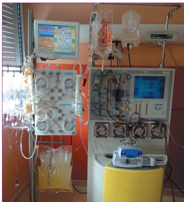
Figure 1. The generators used to perform immunoadsorption. On the left of the image is the ADAorb® generator, and on the right hand side, the Com.Tec® generator

In the setting of HLAi kidney transplantation, the recipient may have donor-specific alloantibodies (DSA) at pre-transplant. DSA can then act against HLA class I (A, B, or Cw) and/or HLA class II (DR, DQ, or DP) antigens. If DSAs are left, they quickly cause acute antibody-mediated rejection at posttransplant, despite immunosuppression [12]. Therefore, for pairs in whom the recipient has DSA(s) against the donor, we need to implement a desensitization protocol at pre-transplantation. This relies: 1) on removing DSAs by via plasmapheresis, 2) preventing their subsequent synthesis using rituximab infusion; and 3) starting conventional immunosuppression, i.e., tacrolimus, mycophenolic acid, and steroids at 7–10 days pre-transplantation [11]. Desensitization can also include intravenous IV-Ig infusions (for